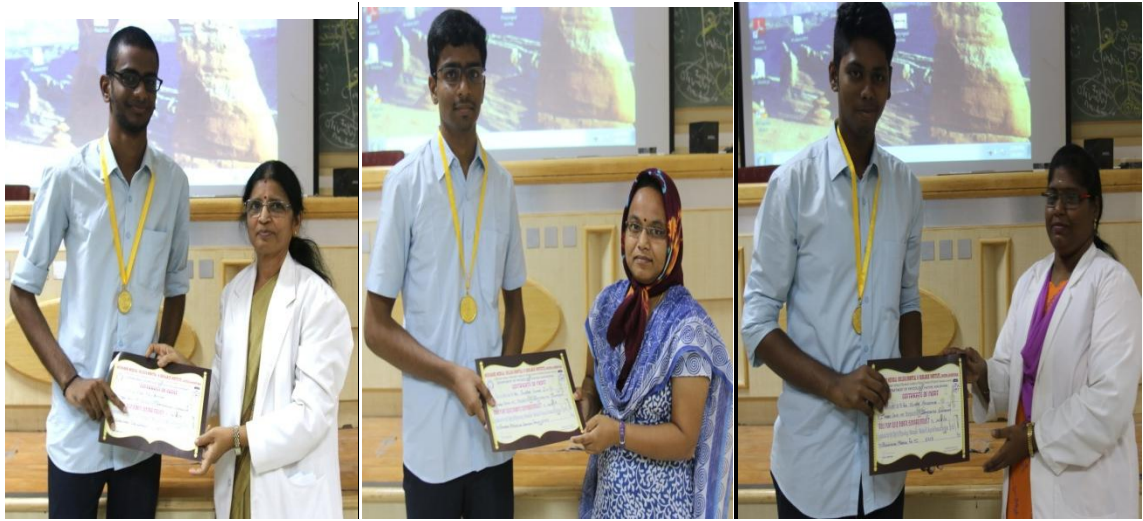
Students were appreciated with Medals and Certificates by the Faculties